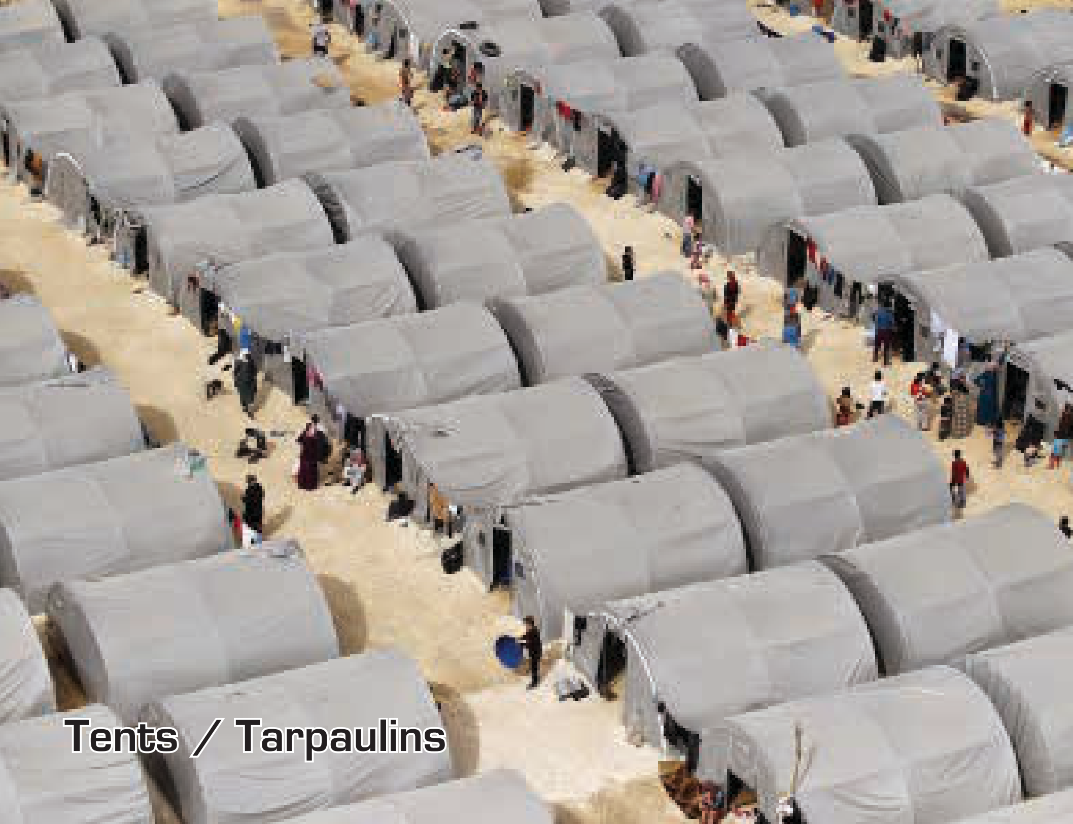
Tents / Tarpaulins